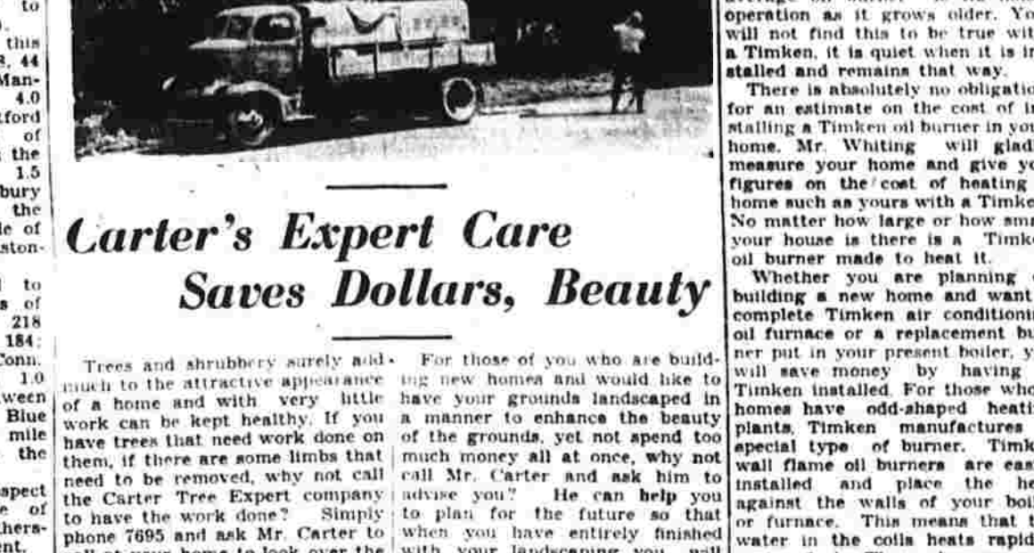
Carter's Expert Care Saves Dollars, Beauty

Surface Treatment to Be Applied in Town Over This Week-End Hartford, June 10.—The State Highway department's bituminous treatment program continues with the schedule for the week of June 12 commencing today.